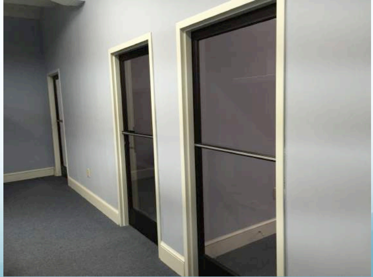
Example of office layout and potential conference room space.