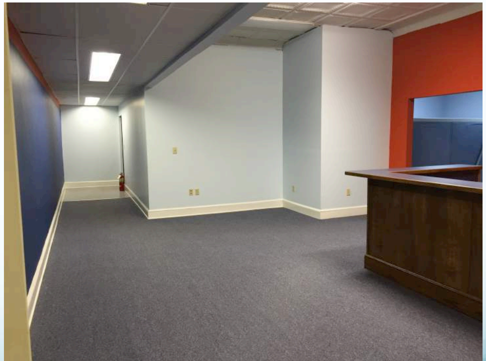
Reception Area- Entrance